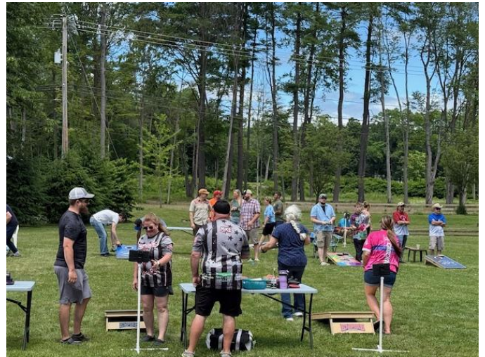
(Veteran's Business Council Cornhole Tournament)